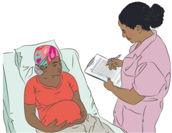
Figure 2: Assessment in Labour

The modified partograph (or partogram), formerly recommended by the WHO, is the most common labour monitoring tool used during the active phase of labour. If the partograph is currently in use, replacing the partograph with the WHO LCG will require considerable health systems commitments to ensure an enabling environment and its consistent use. Maternal and newborn health stakeholders and decision-makers must therefore understand the LCG's advantages over use of the WHO modified partograph, and that its use should support implementation of the new WHO intrapartum care recommendations and lead to better experiences of care and outcomes.