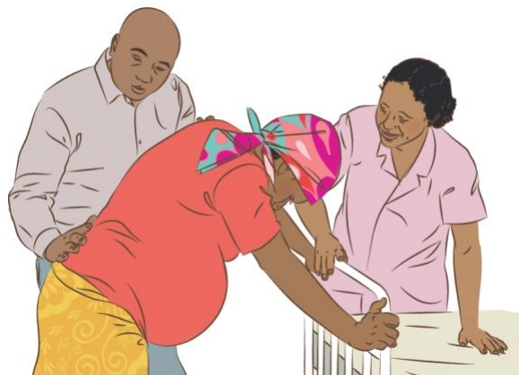
Figure 1: Labour support Prolonged and Obstructed Labour

Ensuring that skilled personnel practise according to evidence-based standards is important since it affects the quality and cost of care that women and newborns receive and facilitates optimal maternal and newborn outcomes. Although there is a wealth of clear guidance for evidence-based maternity care, there remains a widespread and continuing underuse of beneficial practices and overuse of harmful or ineffective practices. The WHO LCG: