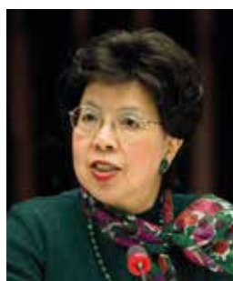
Dr Margaret Chan Director-General World Health Organization

The findings in this year's World Malaria Report demonstrate that the world is continuing to make impressive progress in reducing