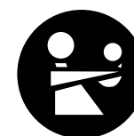
International Pediatric Association

The financial support towards the preparation and production of the 2006 version was provided by UNFPA, the World Bank and the Governments of Australia, Japan and the United States of America.