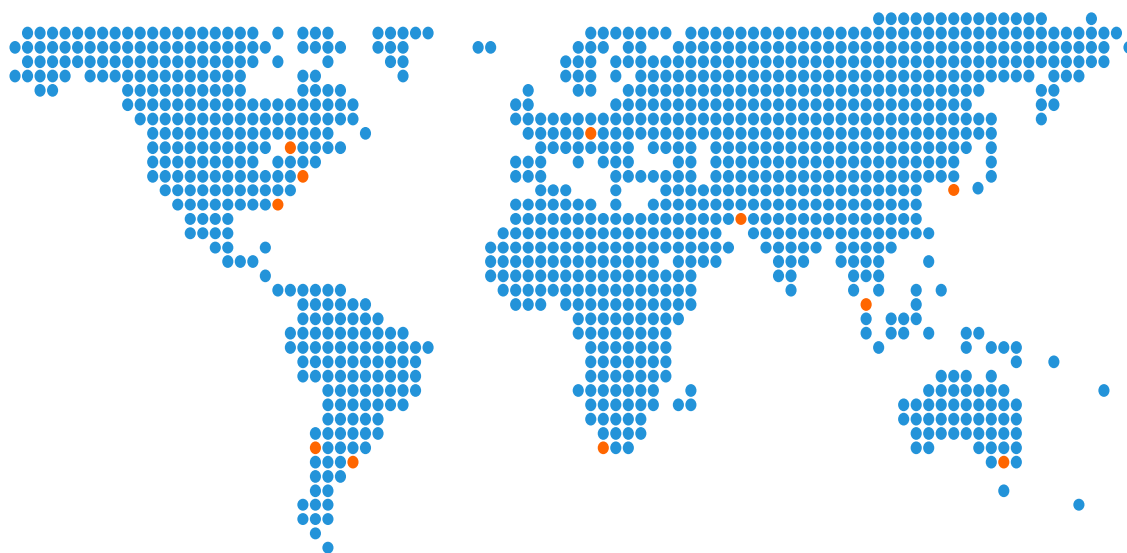
Image 1: Global Network of WHO Collaborating Centres for Bioethics