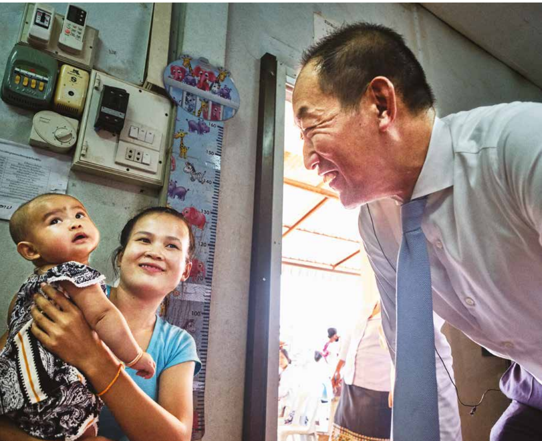
Khoksivilay Health Center in Xaithany District, Lao People's Democratic Republic.