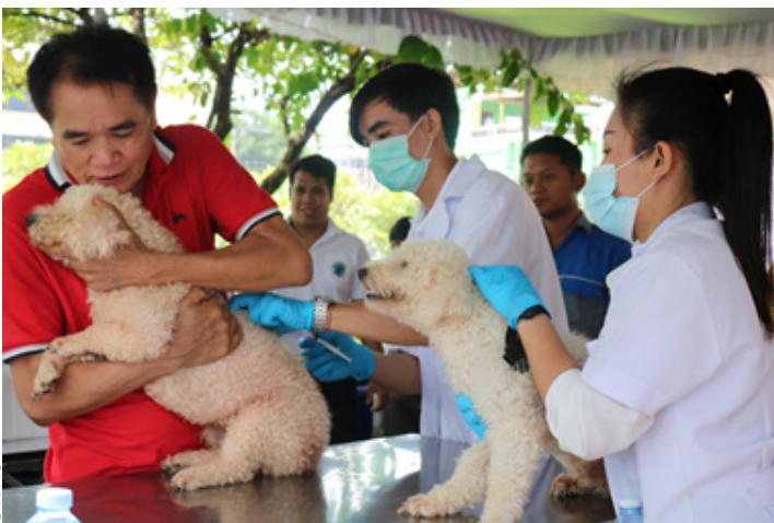
Free dog vaccination, World Rabies Day, Vientiane Capital, Lao PDR 28 September 2020

A World Rabies Day event to raise public awareness about rabies prevention and provide free dog vaccination was held in Vientiane Capital and Xayabouly province. The event was chaired by the Vice Minister of Health, Vice Minister of Agriculture, WHO Representative and FAO Representative in Lao PDR. It was held on 28 September 2020 in Vientiane Capital, and on 1 October 2020 in Xayabouly province.