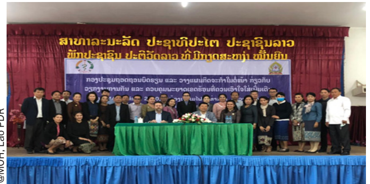
NTD Annual Partners Meeting, Vientiane, Lao PDR, 14 - 15 December 2020

The NTD Annual Partners Meeting was convened in Vientiane from 14 to 15 December 2020 to share progress, challenges and lessons learnt in controlling priority NTDs, namely soil-transmitted helminthiasis, schistosomiasis and opisthorchiasis. The meeting was chaired by the Vice Minister of Health, Vice Minister of Education and Sport, and the WHO Representative and attended by representatives from both ministries at national and provincial levels.