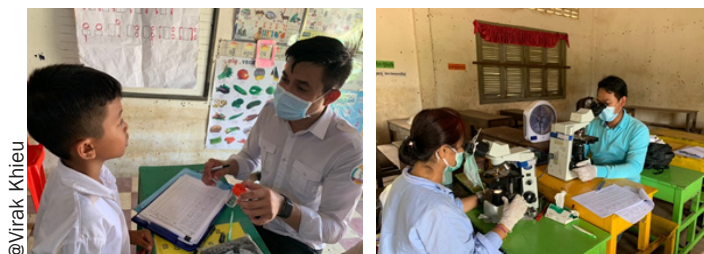
Soil-transmitted helminth prevalence survey among school-aged children, Kampong Speu province, Cambodia, August-September 2020

Together with local health authorities (provincial, district and commune) and school teachers, the National Helminth Control Programme assessed the prevalence and intensity of soil-transmitted helminthiasis among school-aged children to monitor the impacts of semi-annual school deworming. The assessment was carried out in 12 primary schools of Siem Reap, Koh Kong, Kampong Speu, Prey Veng, Battambang and Kampong Thom provinces from August to September 2020.