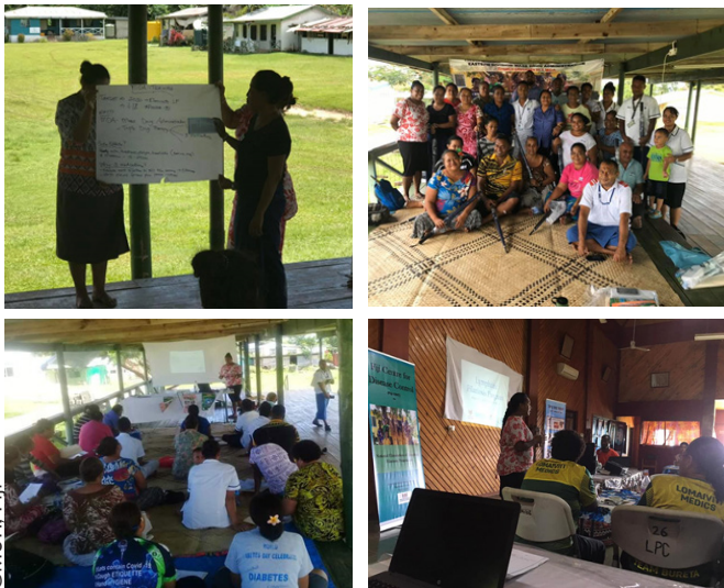
MDA training in Lomaiviti, Eastern Division, Fiji, December 2020

MDA against LF using triple drug therapy (IDA1) was completed in Serua (Talenua) and Malolo Islands in November 2020. LF MDA training for Eastern Division was organized in December 2020. MDA using triple drug therapy in Eastern Division (IDA1) is expected to commence in February 2021.