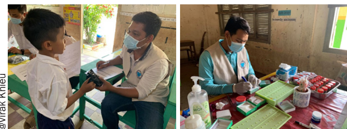
Survey on efficacy of albendazole among school-aged children in Kampong Chhnang province, Cambodia, October 2020

The National Helminth Control Programme, together with local health authorities and with the support of the University of Ghent, Belgium, conducted a survey to assess the efficacy of albendazole (400 mg) against soil-transmitted helminthiasis in 914 school-aged children in Kampong Chhnang province in October 2020. Preserved stool samples were sent to the University of Ghent for further analysis to detect genetic markers related to anthelmintic resistance.