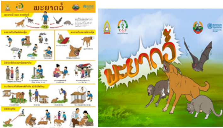
Poster and flip book produced in July-August 2020 on rabies prevention and control for use in primary and secondary school curricula in Lao PDR