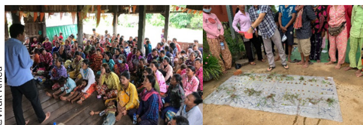
CL-SWASH activities in schistosomiasis-endemic villages, Kratie and Stung Treng provinces, Cambodia, August 2021

The CL-SWASH (Community-led multi-sectorial plan to eliminate schistosomiasis and other parasitic and waterborne diseases) was implemented in six new schistosomiasis villages (four in Kratie province and two in Stung Treng province) in August 2020. The National Helminth Control Programme of the Ministry of Health coordinated the work, in collaboration with the Department of Rural Health of the Ministry of Rural Development, the Provincial Health Department, the Provincial Department of Rural Development, the Provincial Department of Education Youth and Sport, the District Office of Education Youth and Sport, the District Office of Rural Development, Health Centres, Operational Districts of Health and commune leaders.