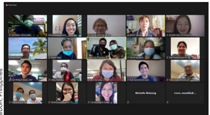
Virtual consultation on routine community deworming, Philippines, 26 May 2020

DOH Memorandum 2020-0260 (Interim Guidelines on Integrated Helminth Control Program and Schistosomiasis Control and Elimination Program during the COVID-19 Pandemic) and DOH Circular 2020-0302 (Delivery of Routine Deworming Services under the Integrated Helminth Control Program during the COVID-19 Pandemic) laid out options on how to conduct routine deworming for the July 2020 Deworming Campaign, using a fixed-post approach (barangay health centres, barangay outposts, private clinics and churches) along with outreach or home visit approaches. These strategies were discussed virtually with the regional implementers and various programme stakeholders on 26 May 2020.