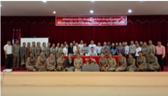
Participants at the training session on the integrated school curriculum on rabies prevention and control, Xayabouly province, Lao PDR, September 2020

A World Rabies Day event to raise public awareness about rabies prevention and provide free dog vaccination was held in Vientiane Capital and Xayabouly province. The event was chaired by the Vice Minister of Health, Vice Minister of Agriculture, WHO Representative and FAO Representative in Lao PDR. It was held on 28 September 2020 in Vientiane Capital, and on 1 October 2020 in Xayabouly province.