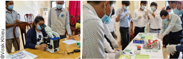
Kato-Katz training for laboratory technicians at provincial and district referral

The National Helminth Control Programme provided training on the Kato-Katz stool examination technique for 45 laboratory technicians from the referral and district hospitals of five provinces (Kampong Chhnang, Pursat, Battambang, Banteay Meanchey and Oddor Meanchey) from 18 to 19 November 2020.