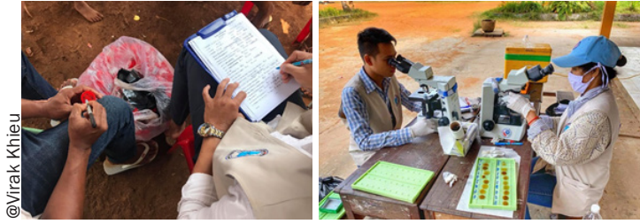
Taenia spp. survey in five provinces of Cambodia, October 2020

The National Helminth Control Programme provided training on the Kato-Katz stool examination technique for 45 laboratory technicians from the referral and district hospitals of five provinces (Kampong Chhnang, Pursat, Battambang, Banteay Meanchey and Oddor Meanchey) from 18 to 19 November 2020.