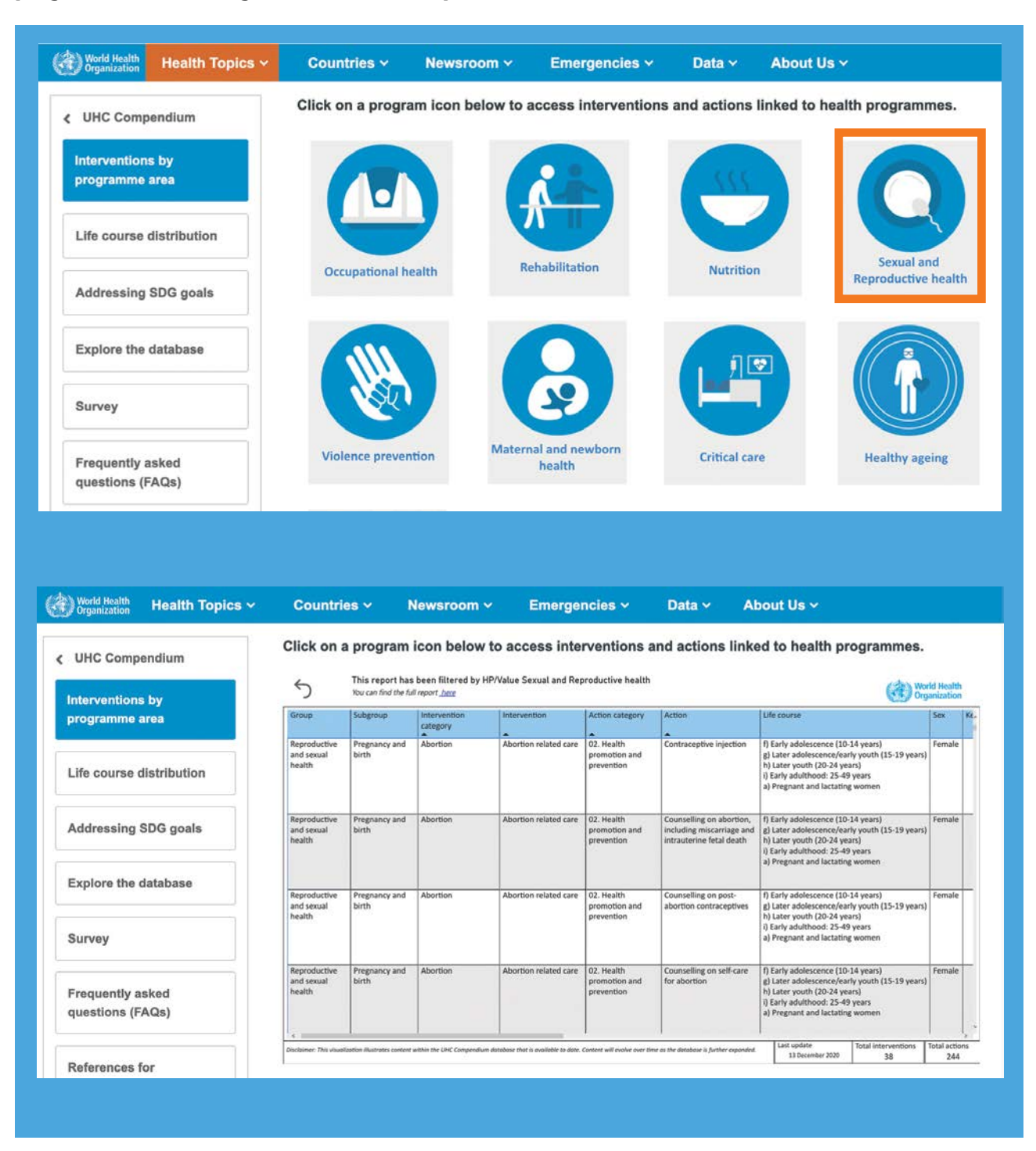
Figure 1. "Health programme" searches return comprehensive lists of services for entire programmes, including for "sexual and reproductive health"

Figures 1 and 2 show how to locate SRH interventions in the UHC Compendium, and Figure 3 shows the example of accessing contraception and family planning.