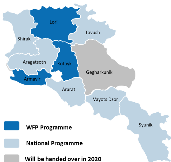
Figure 1. Provinces under National and WFP Programme