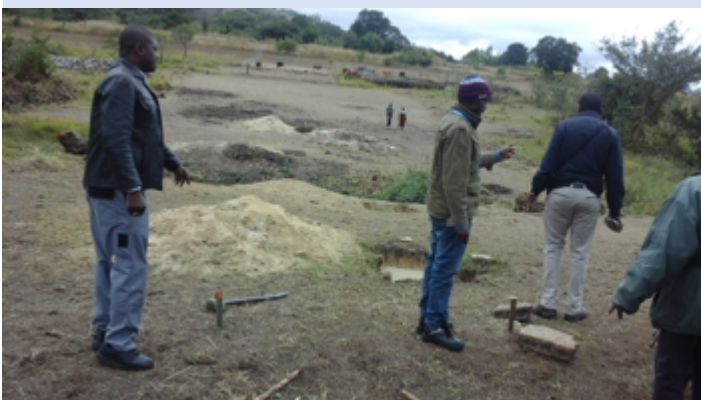
Before the intervention