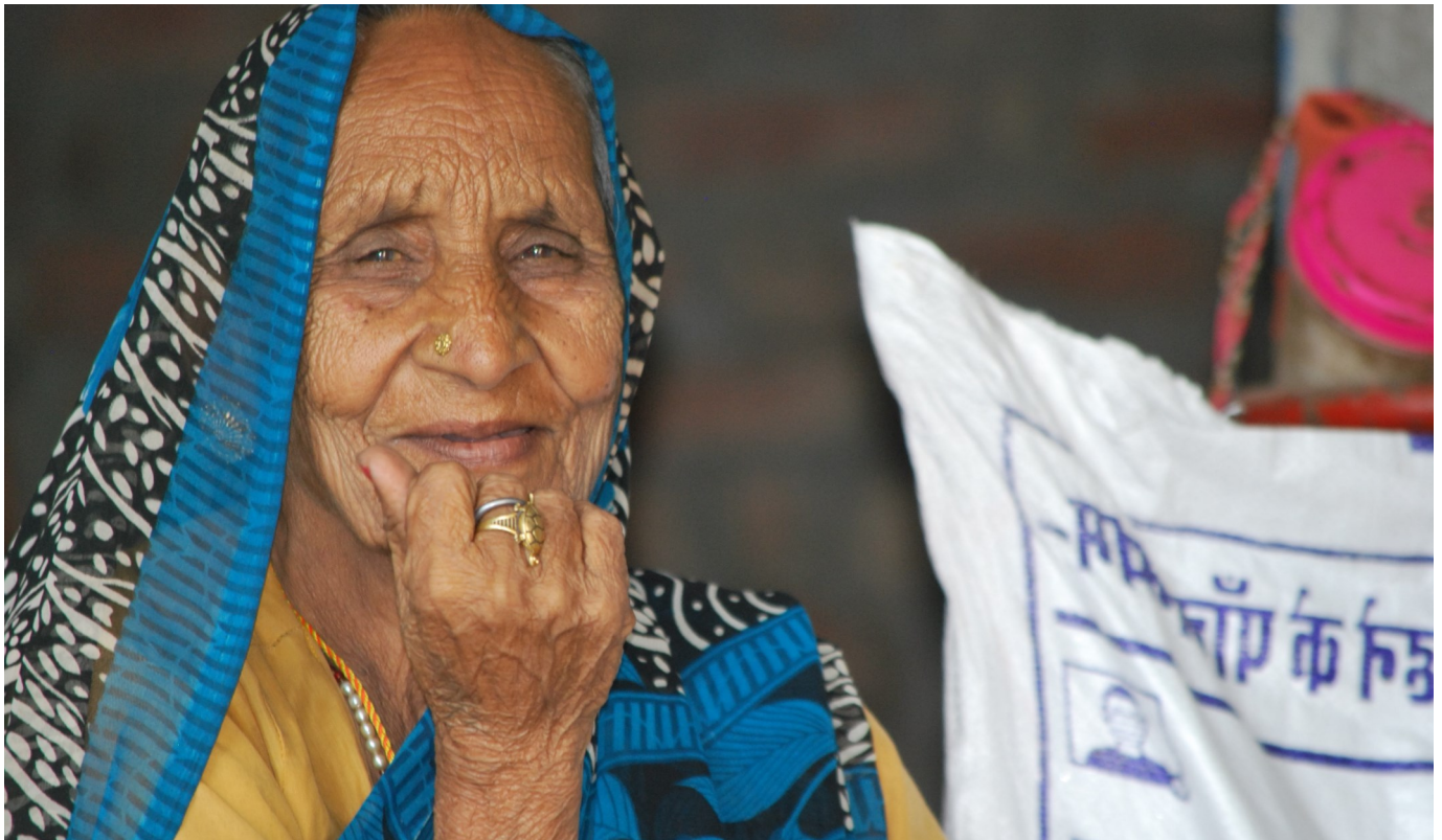
An elderly woman in Lucknow who received one-time food assistance from WFP supported state-level NGO partner. Reaching the unreached households who were unable to access food safety net has been a priority.