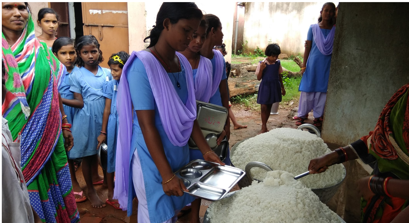
School students receiving fortified rice as cooked hot Mid-day Meal.