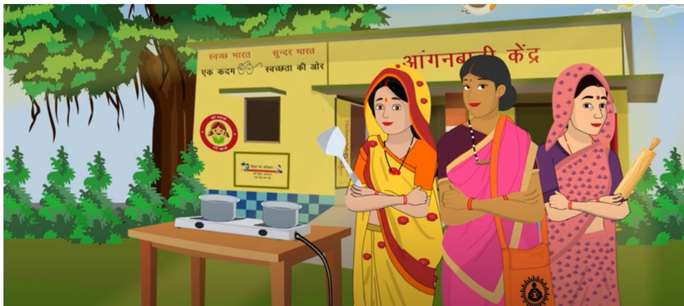
A screen shot from an instruction video for preparing Take Home Ration.