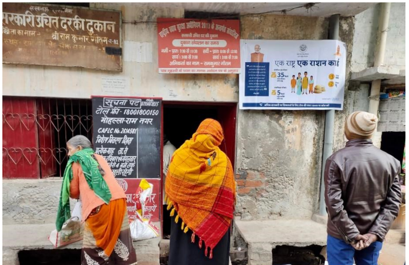
A ration shop with One Nation One Ration Card poster to create awareness on portability to enable beneficiaries to continue accessing food regardless of their location.