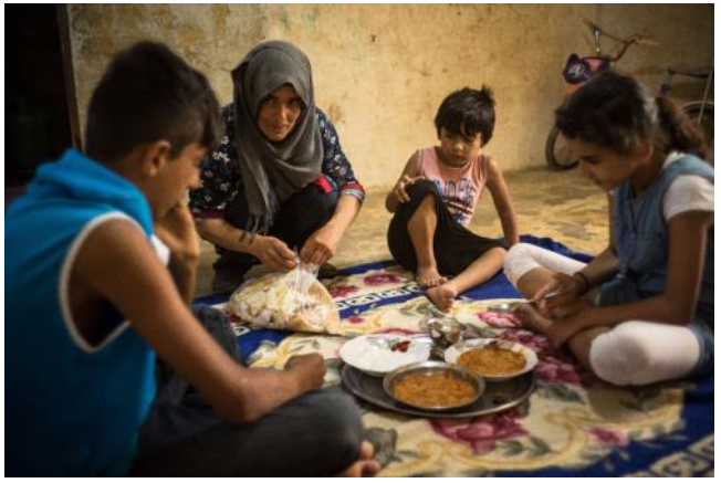
A Lebanese family receiving NPTP assistance gather for lunch at their home in North Lebanon.