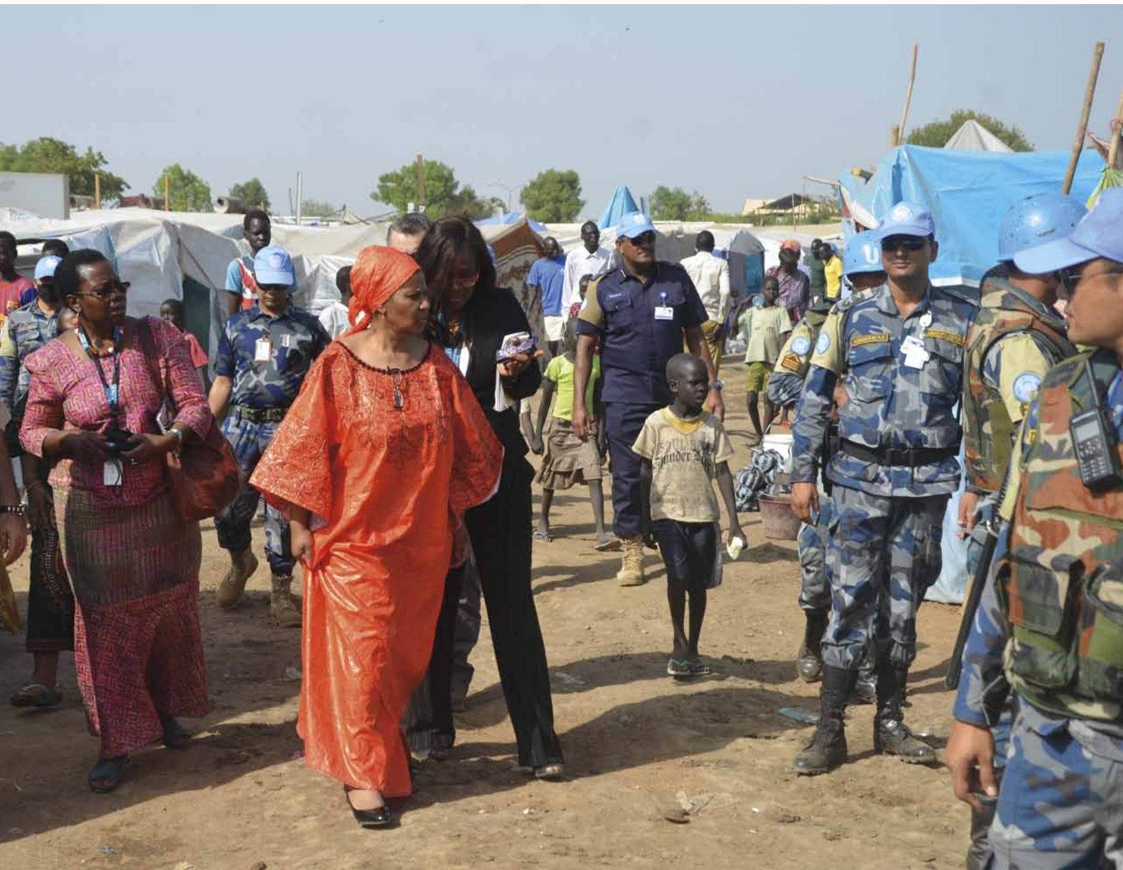
ABOVE: UN Women Executive Director Phumzile Mlambo-Ngcuka visited the Tamping camp for internally displaced people in South Sudan. Women there face desperate conditions, but are determined to rebuild their country. A sign of progress: Both parties to peace talks included women on their negotiating teams.

IN 2013 UN WOMEN DELIVERED DIRECT PROGRAMME SUPPORT IN 96 COUNTRIES, WITH THE LARGEST AREAS OF SUPPORT FOCUSING ON ENDING VIOLENCE AGAINST WOMEN (85 COUNTRIES), ON LEADERSHIP AND PARTICIPATION (71) AND ECONOMIC EMPOWERMENT (67).