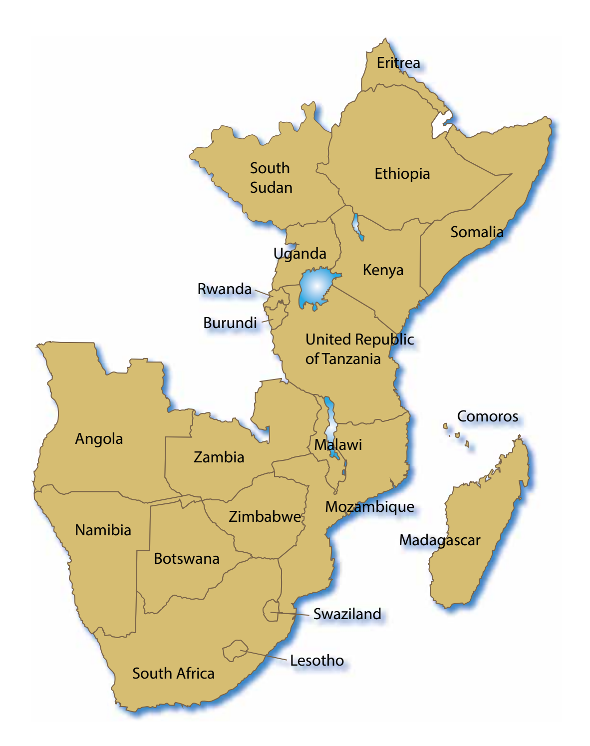
Map of the Eastern and Southern Africa Region