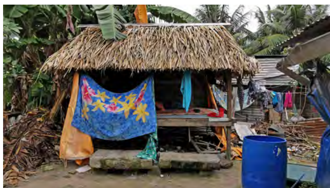
Photo above: Makeshift surge shelter to protect women and their families from cyclone related flooding in the Republic of Kiribati.