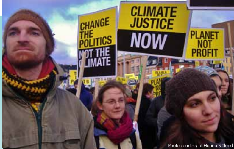
COP 15 Demonstration, December 2009.

An active citizenry and contestation are crucial for transforming relations of power and patterns of inequality that underpin poverty and unsustainable growth. Governance arrangements that allow the expression of alternative perspectives, facilitate the collaboration and coordination of multiple stakeholders and foster meaningful participation are also key.