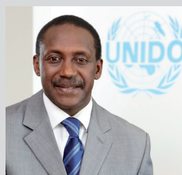
Kandeh K. Yumkella, Director-General, UNIDO

More than ever, the unique partnership that unites the African Union and UNIDO is needed, to address today’s