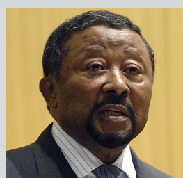
Jean Ping, Chairman, African Union Commission

challenges and to prepare Africa for a brighter future; as another African proverb says, “for tomorrow belongs to the people who prepare for it today”.