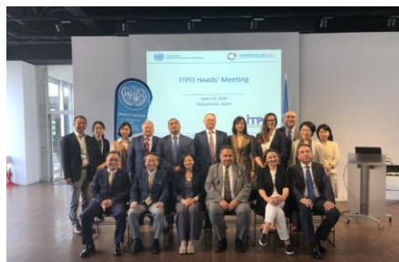
ITPO Heads Meeting at Tokyo, Japan