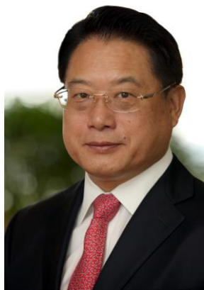
Mr. Yong Li Director General of UNIDO

UNIDO is the specialized agency of the United Nations that promotes industrial development for poverty reduction, inclusive globalization and environmental sustainability.