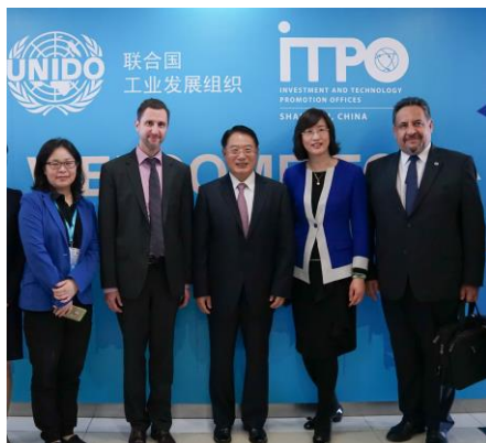
DG Visited Center of Excellence and met with ITPO Shanghai Staffs