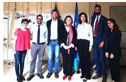
ITPO Shanghai Visited ITPO Italy