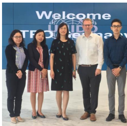
ITPO Germany Study Tour in Shanghai