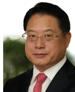
Li Yong Director General of UNIDO

The achievements of UNIDO and the European Union cooperation in previous years pave the way for the deepening of our cooperation and call for the replication and scaling-up of successful projects and initiatives. I thank our partners in the European institutions for their support, and look forward to increasing the collaboration between UNIDO and the EU to advance the achievement of the ambitious goals of the 2030 Agenda.