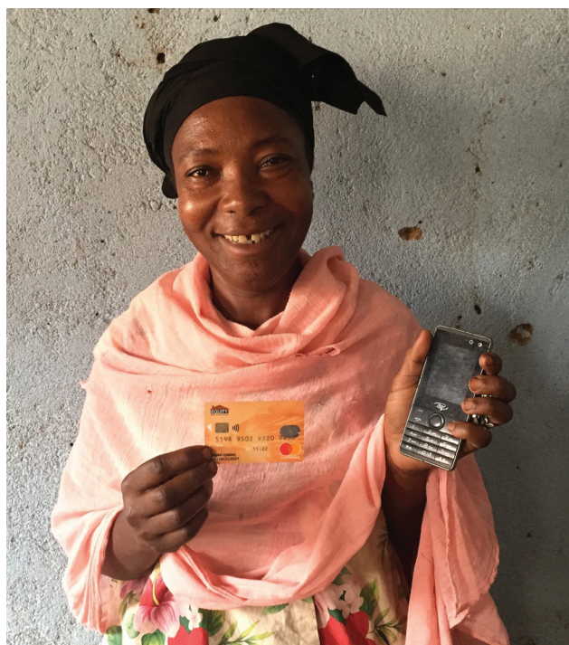
Digital payments in Uganda

The government of Morocco has declared a state of national health emergency responding to the increasing number of persons contracted COVID-19. UNHCR has therefore advanced the payments under the existing cash assistance for the most vulnerable, and reprioritized within the current available funds to support all refugees with a one-time off cash assistance to alleviate the economic impact of COVID-19.