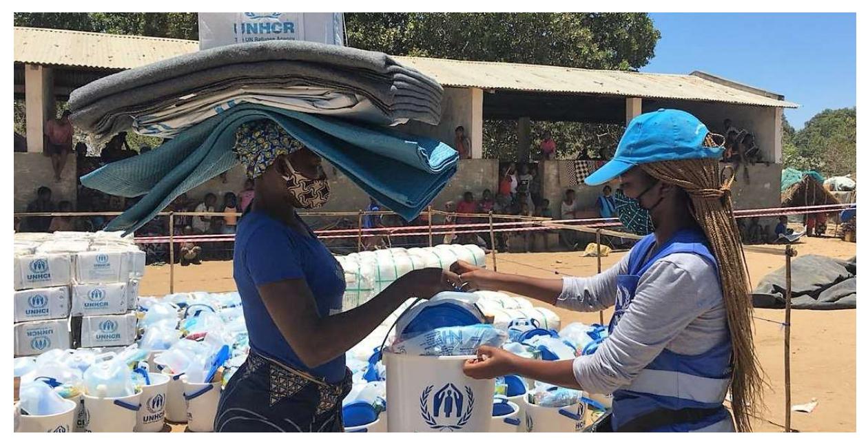
UNHCR staff distributes core relief items to a displaced woman in Cabo Delgado Province, Mozambique.

As the situation in Cabo Delgado continues to deteriorate, UNHCR is preparing for a longer-term response in northern Mozambique. It is critical that UNHCR receives adequate funding to maintain and further strengthen its work in the interest of displaced people and those affected by the violence.