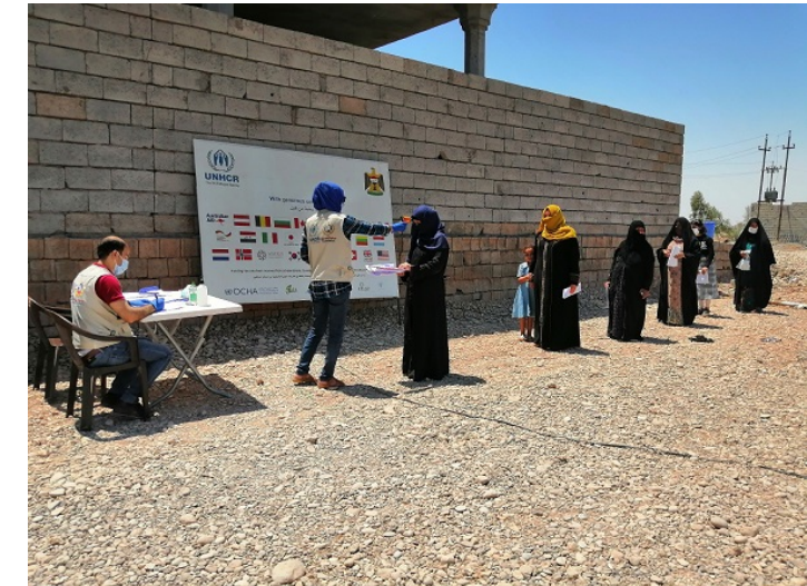
IDP women and girls of reproductive age in Tuz - Kirkuk being assisted with sanitary kits.