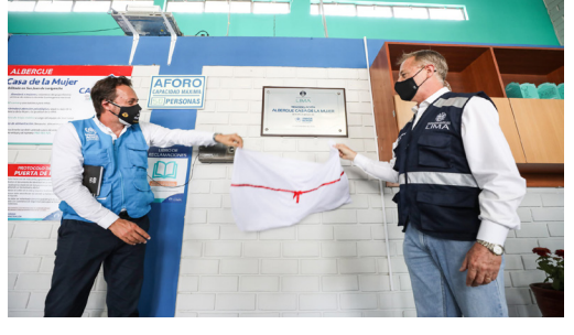
Watch "Casa de la Mujer" opening ceremony

UNHCR supported the "Casa de la Mujer", a safe shelter run by the Municipality of Lima that provides support to SGBV survivors with the installation of a bio-farm. The process was conducted through a participatory workshop on occupational therapy for women, girls and boys hosted in the shelter. This initiative aims to foster integration between refugees and host communities, strengthen SGBV interventions, while including an environmental and waste management component.