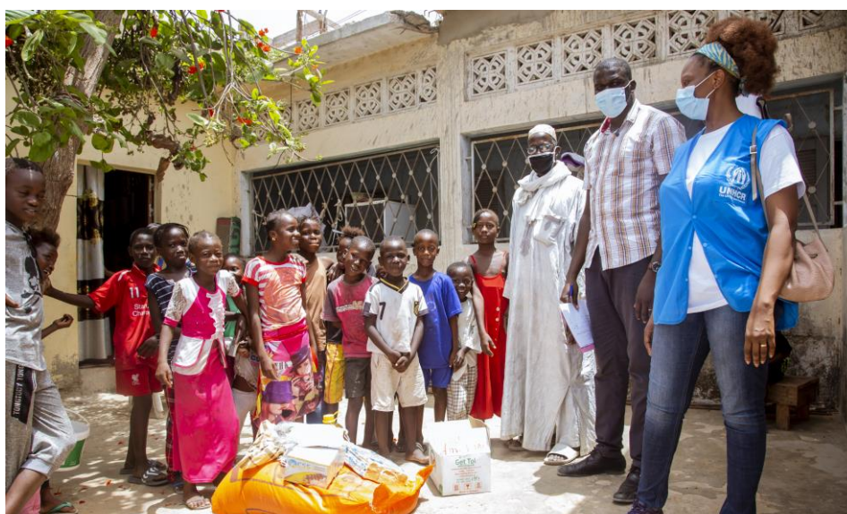
Senegal / Distribution of Covid-19 assistance to refugees