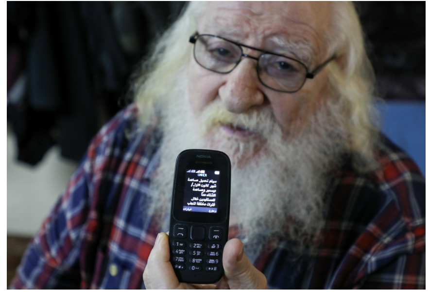
UNHCR helps refugee families in Jordan with cash assistance this winter.

monthly assistance. The average cost of the full package is JOD 233 (around USD 329) and the average cost of the reduced package is JOD 190 (around USD 268). Both packages aim to cover winter assistance for a period of four months and persons of concern will receive cash assistance once.