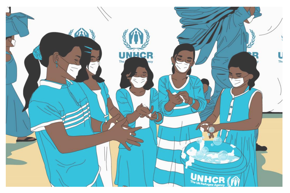
Geórgia, 18, Brazil, UNHCR 2020 Youth With Refugees Art Contest

Examples of UNHCR gender responsive and gender-based violence (GBV) prevention, risk mitigation and response interventions