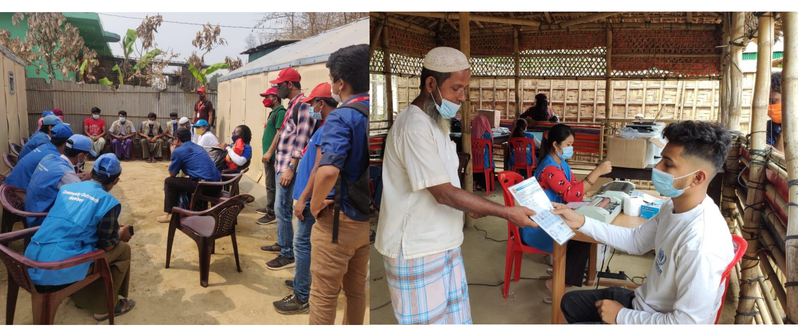
UNHCR and partner Action Aid consult with volunteer Community Outreach Members outside the interim community centre in Camp 9.