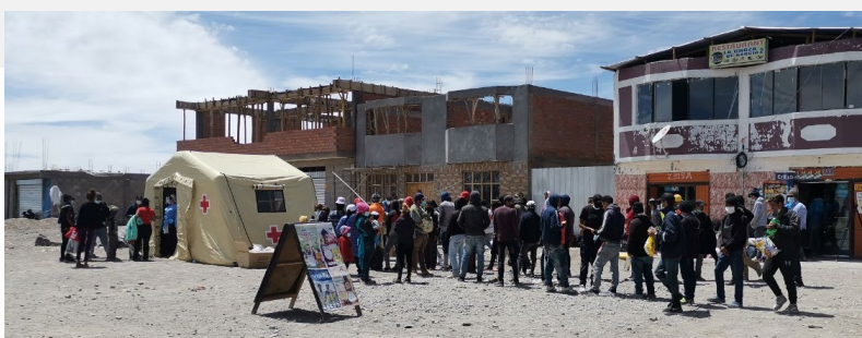
Venezuelan refugees and migrants lining up for medical checks in northern Chile