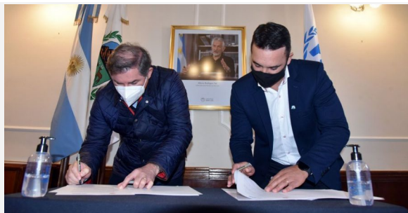
Signature of Cities of Solidarity agreement with San Luis city

COVID-19 pandemic has been halting most of resettlement efforts worldwide. In spite of this, in Argentina , a mentorship pilot that would strengthen the reception and integration of resettled refugees by engaging local volunteer mentors and with the sponsoring raised through crowdfunding facilitated in cooperation with UNHCR private sector partner (Fundación ACNUR Argentina) is underway. In Uruguay , UNHCR has agreed a new national resettlement plan with the government and labour insertion schemes as complementary pathways are being designed.