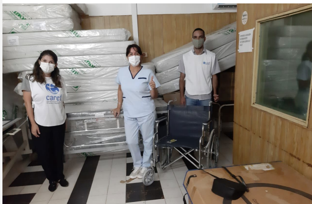
Delivery of bio-protection supplies for a hospital in Puerto Iguazu

Over the first half of the year UNHCR has directly supported different organizations and governments, i.e. providing for the rental of portable toilets to place at border points in Uruguay (Rivera), as well as jackets, padding and bedding for the winter for 500 people . In Argentina , UNHCR supported the Argentine National Directorate of Migration with the purchase of 2 trailers to be used as mobile offices, purchase of bio-protection supplies for the Hospital de La Quiaca, Puerto Iguazú, and the Province of Buenos Aires, as well as with the food delivery for community-based organizations that provide 300 lunches a day to Venezuelan families.