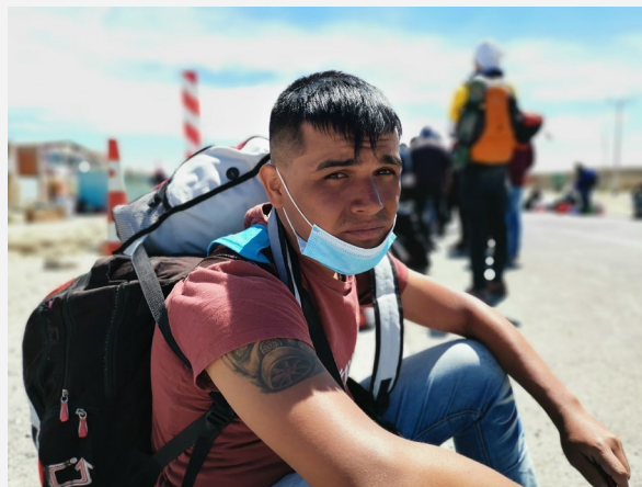
Venezuelan man in Colchane, Chile after crossing the border

In Argentina UNHCR continues working closely with the National Refugee Commission (CONARE), ensuring the reinforcement of its capacities (including training sessions on refugee law standards and RSD procedures) and it has supported the refurbishing of its premises for US$ 1.3 M. Through UNHCR advocacy and support to Venezuelan grassroot organizations, the National Directorate for Migrations in Argentina announced the adoption of the Resolution for the regularization that will allow more than 6,800 Venezuelan children who entered the country without proving identity and in a situation of extreme vulnerability, to access a provisional ID , thus enabling the full exercise of their rights. In the whole sub-region, some 161 persons have benefited from assistance for family reunifications or resettlement under different protection arrangements.