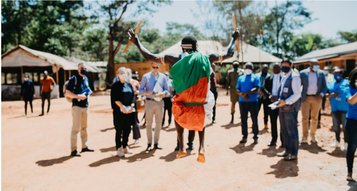
Burundian refugee traditional dancers welcome visiting delegation.