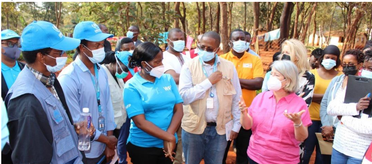
Irish Ambassador visiting Nyarugusu Camp.