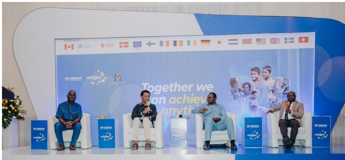
UNHCR Representative and other panelists at the World Refugee Day live broadcast.

World Refugee Day 2021: This year's theme focused on the power of inclusion. The shared experience of COVID-19 has shown us that we only succeed if we stand together. The global campaign thus called for greater inclusion of refugees in health systems, schools and sports under the theme; Together we can achieve anything - Together we heal, learn and shine . Several activities were organized in the three refugee camps (Nduta, Mtendeli, and Nyarugusu), and a mini football tournament was held in Kigoma ( Photos , Video ). The commemorations culminated in a 3-hour live show on TV and social media ( Video , Photos ).