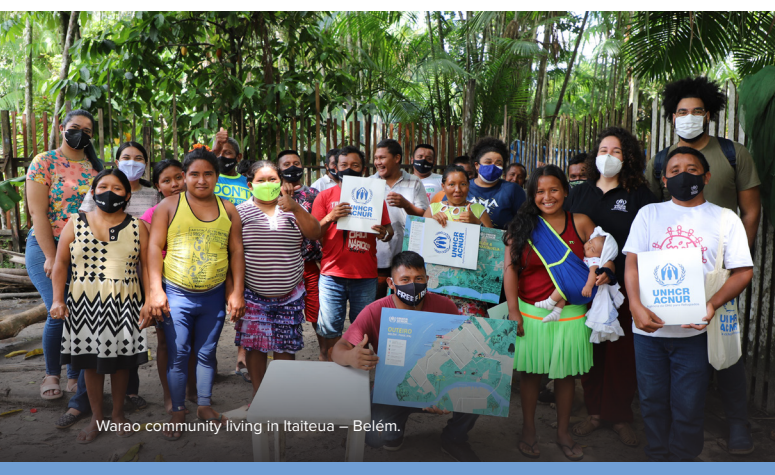
Warao community living in Itaiteua – Belém.