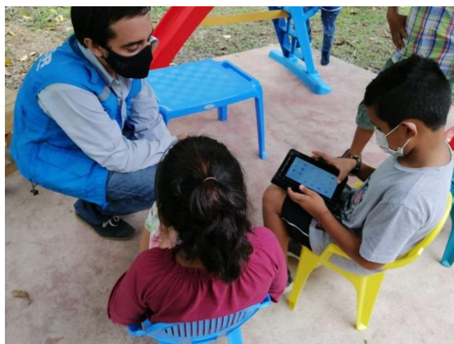
Distribution of tablets to refugee children in Izabal in order to guarantee access to virtual education.