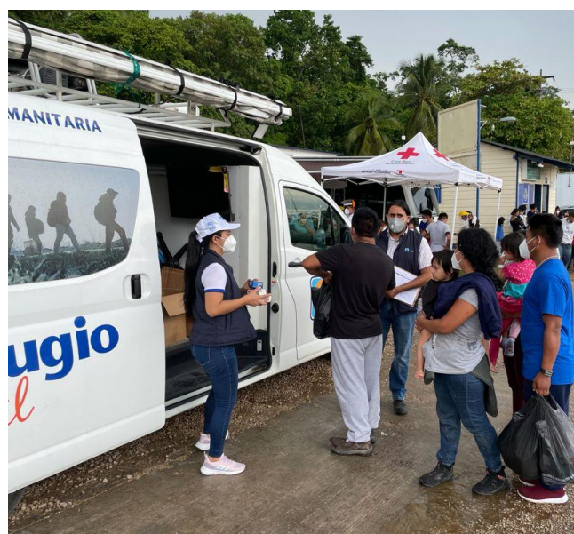
Assistance provided by UNHCR's partners to persons in El Ceibo, Peten.

Additionally, in Tecun Uman on the border with Mexico, large movements of persons from Haiti, mostly travelling with smugglers, have been reported by partners.