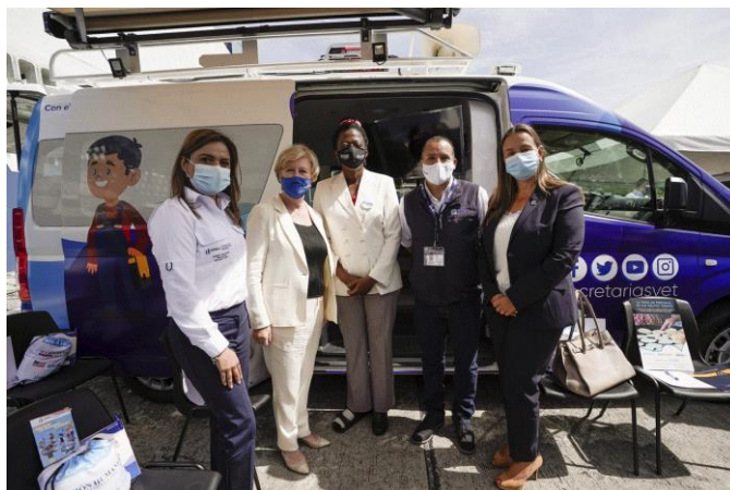
Launch of the mobile units UNIVETs.