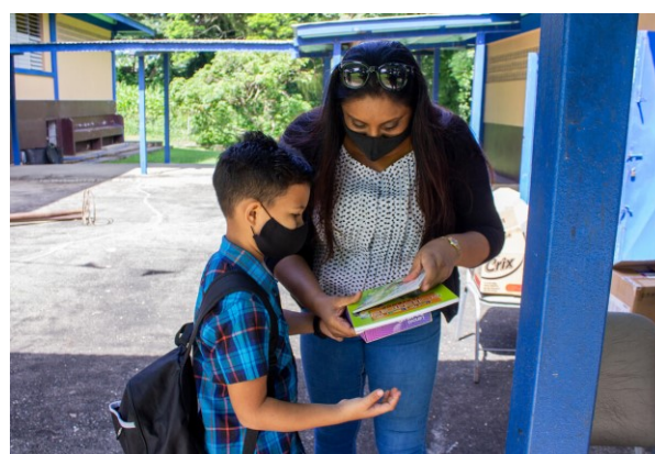
Trinidad and Tobago. Asylum-seeker children who are part of the Equal Place education programme received tablets to help them with their online classes.

In Venezuela, UNHCR operates within the interagency framework to assist the most vulnerable population groups inside the country.