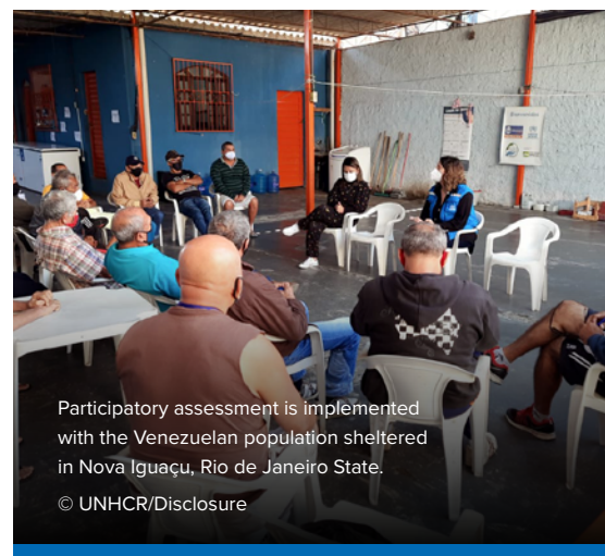
Participatory assessment is implemented with the Venezuelan population sheltered in Nova Iguaçu, Rio de Janeiro State.

In July, UNHCR carried out a participatory assessment with a group of 23 elderly people currently housed at Casa de Acolhida ao Migrante Jardim Paraíso, in Nova Iguaçu/RJ. The group's assessment of the constant support received by the Municipal Social Assistance Secretariat of Nova Iguaçu (SEMAS), including the presence of a caregiver and regular monitoring by CRAS, was positive. Although most elderly people already receive the BPC and have regular access to public health, including access to surgeries and some elective treatments, some challenges remain in these areas, as well as difficulties in entering the labor market and income-generating strategies. UNHCR and Caritas Arquidiocesana of Rio de Janeiro continue to monitor and support the group's protection and integration process in Nova Iguaçu.