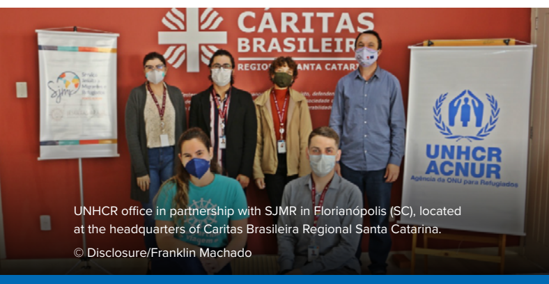
UNHCR office in partnership with SJMR in Florianópolis (SC), located at the headquarters of Caritas Brasileira Regional Santa Catarina.

In July, the partnership between UNHCR and the Jesuit Service for Migrants and Refugees (SJMR) expanded its activities with the opening of new offices in the cities of Florianópolis (SC) and Salvador (BA). SJMR and UNHCR aim to strengthen support for local refugee protection and integration networks, formed by local government, civil society organizations, universities, refugee communities, among other stakeholders.