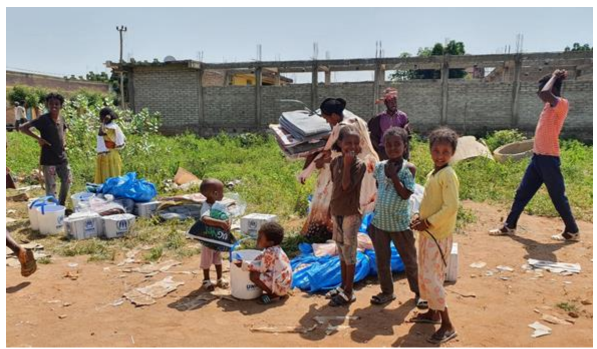
Distribution of core relief items to 8,000 internally displaced persons in Sheraro, Tigray region, Ethiopia