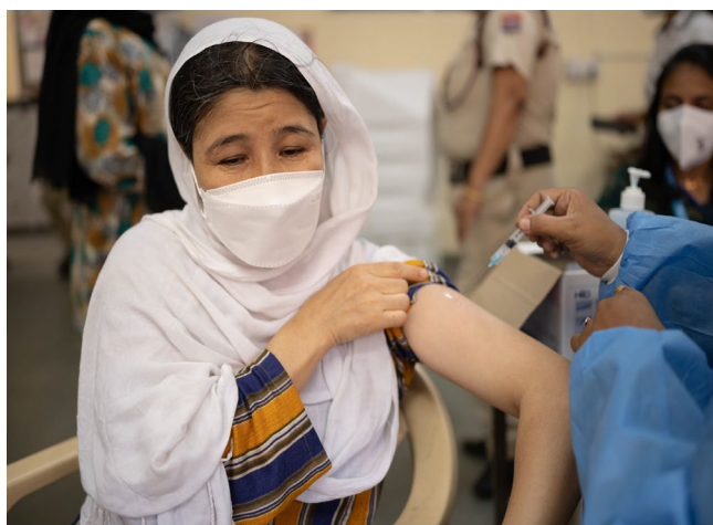
Refugees receive their COVID-19 vaccinations in New Delhi, India.