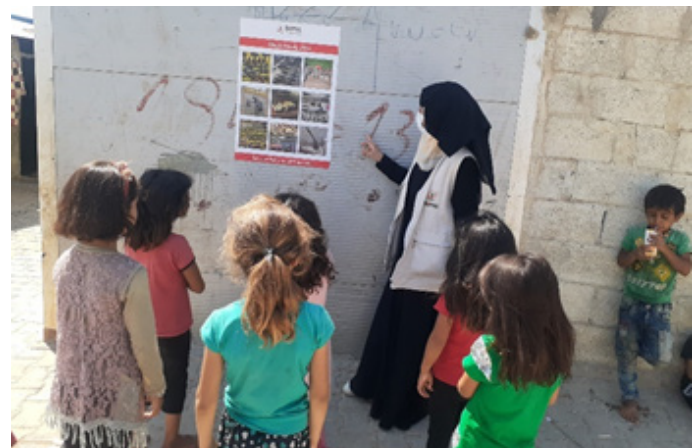
An awareness session on explosive remnants of war (ERW).

UNHCR's protection partners conducted awareness raising and psychosocial support sessions, identified cases and referred them to basic services in Idlib and Aleppo; such community-based protection interventions reached 9,349 people in August. In addition, over 1,300 displaced and vulnerable people received protection services such as awareness raising on civil status documentation and housing, land and properties, legal consultation and assistance.