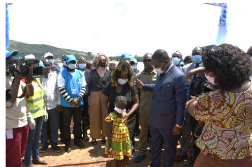
CAR's Prime Minister, Henri Marie Dondra receives a refugee family returning home at Port Amont in Bangui