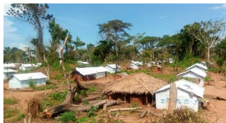
New shelters are being built to provide decent accommodation for refugees at Modale settlement