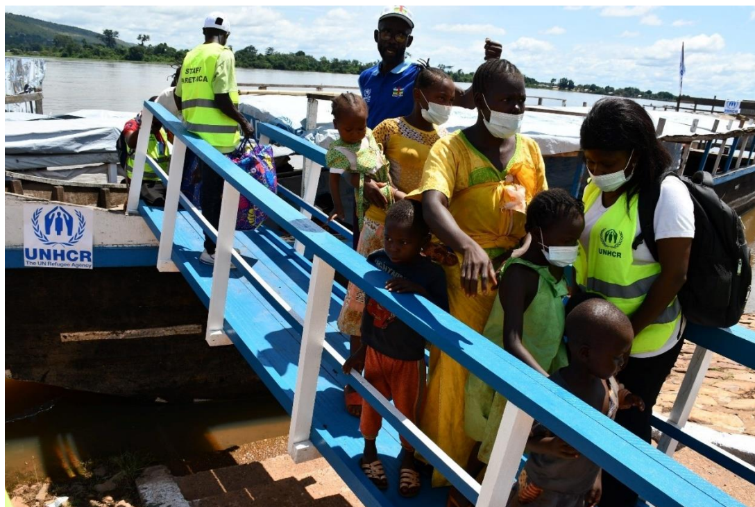
CAR refugees disembark at Port Amont, Bangui, following voluntary repatriation from Mole camp, South Ubangi Province

In South Ubangi Province, 81 CAR refugees at the Mole and Boyabu camps received the second shot of the AstraZeneca vaccine against Covid-19.