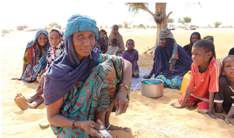
A group of internally displaced persons in Tahoua region