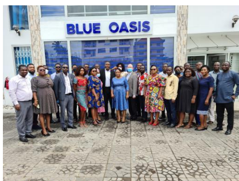
Stakeholder meeting with MMDAs.