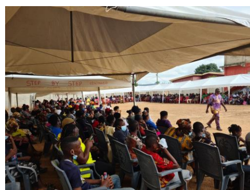
Urban outreach program at Kasoa.