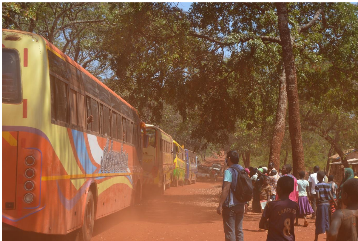
Last Camp Consolidation convoy departing from Mtendeli to Nduta Camp.