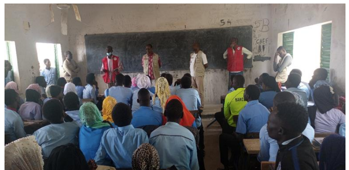
UNHCR and the national Red Cross in Chad discuss mixed movements with communities

UNHCR supported States in the region with the establishment and reinforcement of quality and accessible national protection frameworks and systems. In Burkina Faso , UNHCR advocated for the reform of the asylum law in line with relevant standards and supported the adoption in January 2022 of secondary legislation laying down the role, composition and working modalities of the National Commission for Refugees. In Côte d'Ivoire , UNHCR provided legal and technical assistance to the authorities with the introduction to Parliament of a draft bill expected to become the first legislative framework regulating asylum in the country. In Gabon , UNHCR and the UN Office on Drugs and Crime (UNODC) advised the Ministry of Justice in the context of the reform of the Criminal Code to decriminalise the rescue of and assistance to asylum-seekers and migrants at sea for humanitarian reasons. In Guinea , UNHCR supported the Government with the development of secondary legislation facilitating the implementation of the 2018 asylum law.