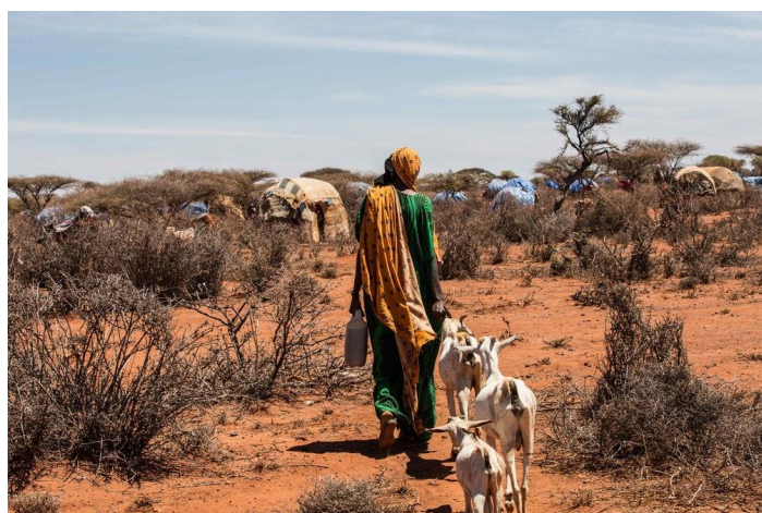
A displaced Mother taking her remaining goat to the new makeshift shelters.