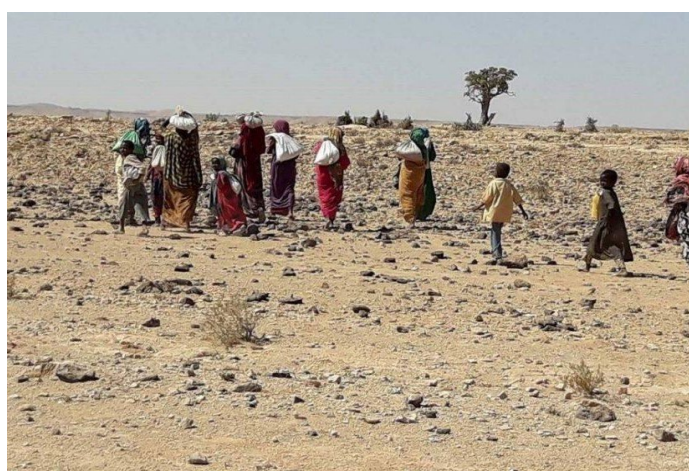
Mothers and children fleeing from the conflict by foot

The PRMN (Protection & Return Monitoring Network) is a UNHCR-led project which identifies and reports on displacements as well as protection risks and incidents underlying such population movements. On behalf of UNHCR and the Norwegian Refugee Council (NRC), 38 local partners in the field in Somalia (South Central regions, Puntland and Somaliland) undertake data gathering (primarily through interviews with affected communities and key informants) and monitoring at strategic locations.