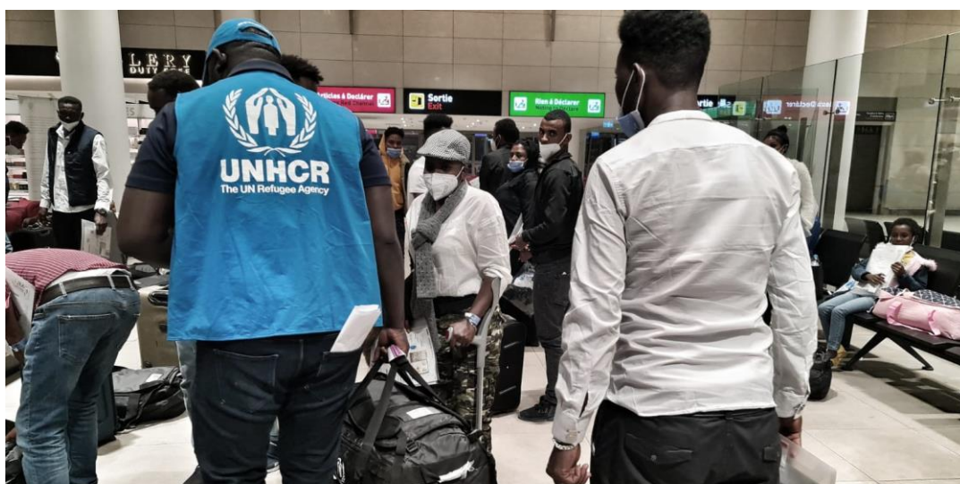
In December 2021, 19 refugees have left for resettlement in third countries, including 10 evacuees from Libya and nine refugees registered in Niger