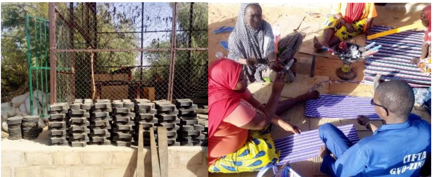
In Tillabéri region, refugees use solid waste to produce bricks and baskets

Within the framework of the joint ILO/UNHCR project , a domestic waste collection and sorting centre and a basket making centre have been set-up for refugees and host community members in Ayorou. Thanks to this project, refugees & host communities work together to produce bricks and baskets.