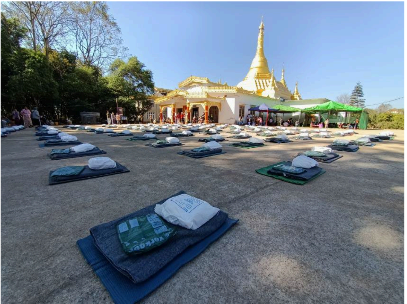
Distribution of non-food items to displaced families in Shan State.

Through triangulation of information, it is estimated that around 31,000 have fled Myanmar to seek safety and protection in India and are presently in the northeastern border states, with some 15,000 of them having arrived just in the past two months. Host communities and CBOs are aiding the new arrivals with immediate lifesaving assistance, and children of those who fled are being integrated into the local education system, with some set to sit for exams this month. Remote protection training on GBV case counselling was provided for local response providers.