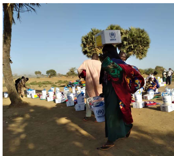
A refugee woman from Cameroon receiving her CRI kit during the distribution of CRIs in Karwaye, Chad.