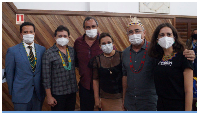
UNHCR Represents, mayor of Belém, president of FUNPAPA and UNAMA's dean pose for a photo on the signing of the Cooperation Agreement.