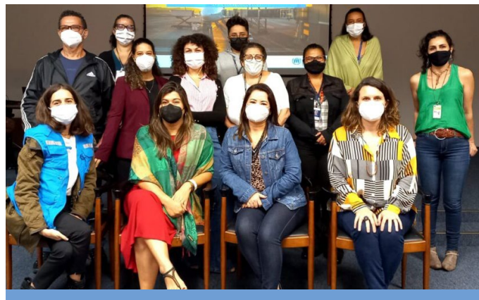
UNHCR representative and representatives of the Humanized Posts of Belém, Guarulhos and Rio de Janeiro close the meeting in Guarulhos.

the Guarulhos Advanced Post took part. The event facilitated the exchange of good practices in the identification and referral of people seeking international protection in these states, which are among the main gateways for this population to enter Brazil.