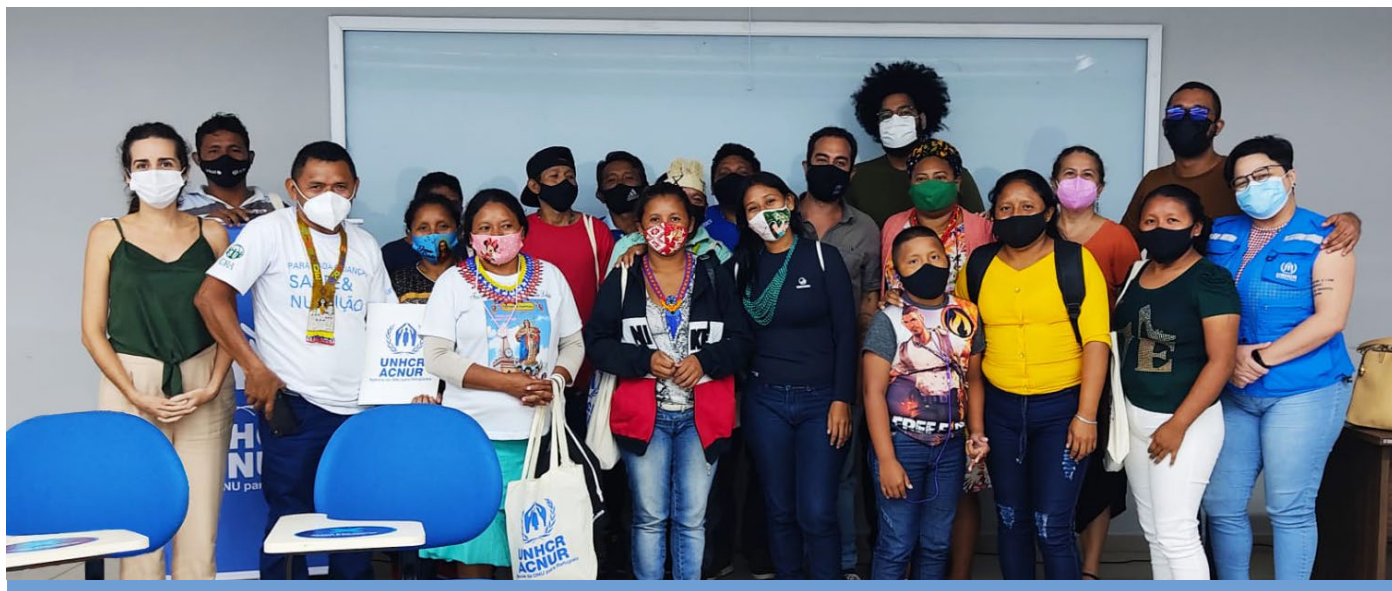
UNHCR Professionals, Warao indigenous people, IEB and SOS Children's Village pose for a photo at the end of the Warao Indigenous Leadership course.