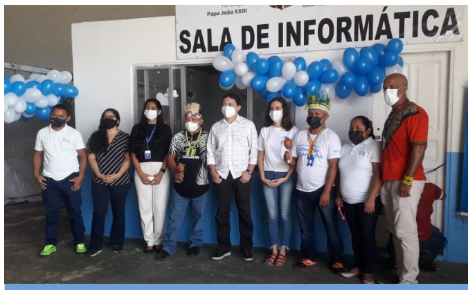
President of FUNPAPA and UNHCR's head of office inaugurate the computer lab together with Warao leaders.

UNHCR supported the opening of a computer lab at the EA Tapanã shelter by donating three laptops and a printer. The room benefits the Warao indigenous people welcomed in the space, who can use it for activities related to study or work.