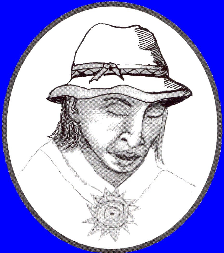
Felt hat worn by Inca women of the Peruvian Andes

The hat worn by the figure to the right and shown on the pages to come was selected to symbolize the councillor role featured in this handbook.