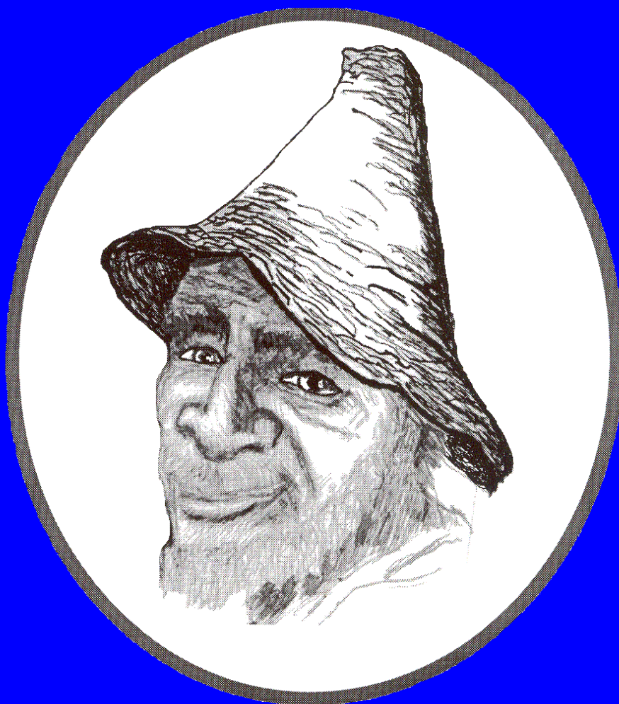
Fibre hat worn by Yemen camel drivers

The hat worn by the figure to the right and shown on the pages to come was selected to symbolize the councillor role featured in this handbook.