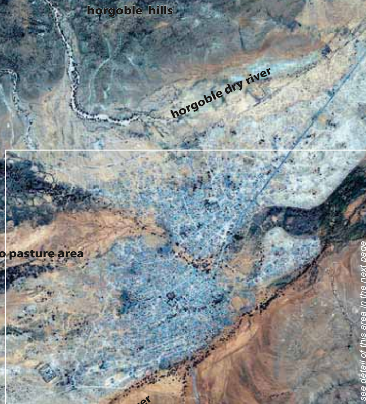
image of the town and its surroundings

The developed area of the town is approximately 280 hectares. Calculations are based on the satellite image taken in 2005.