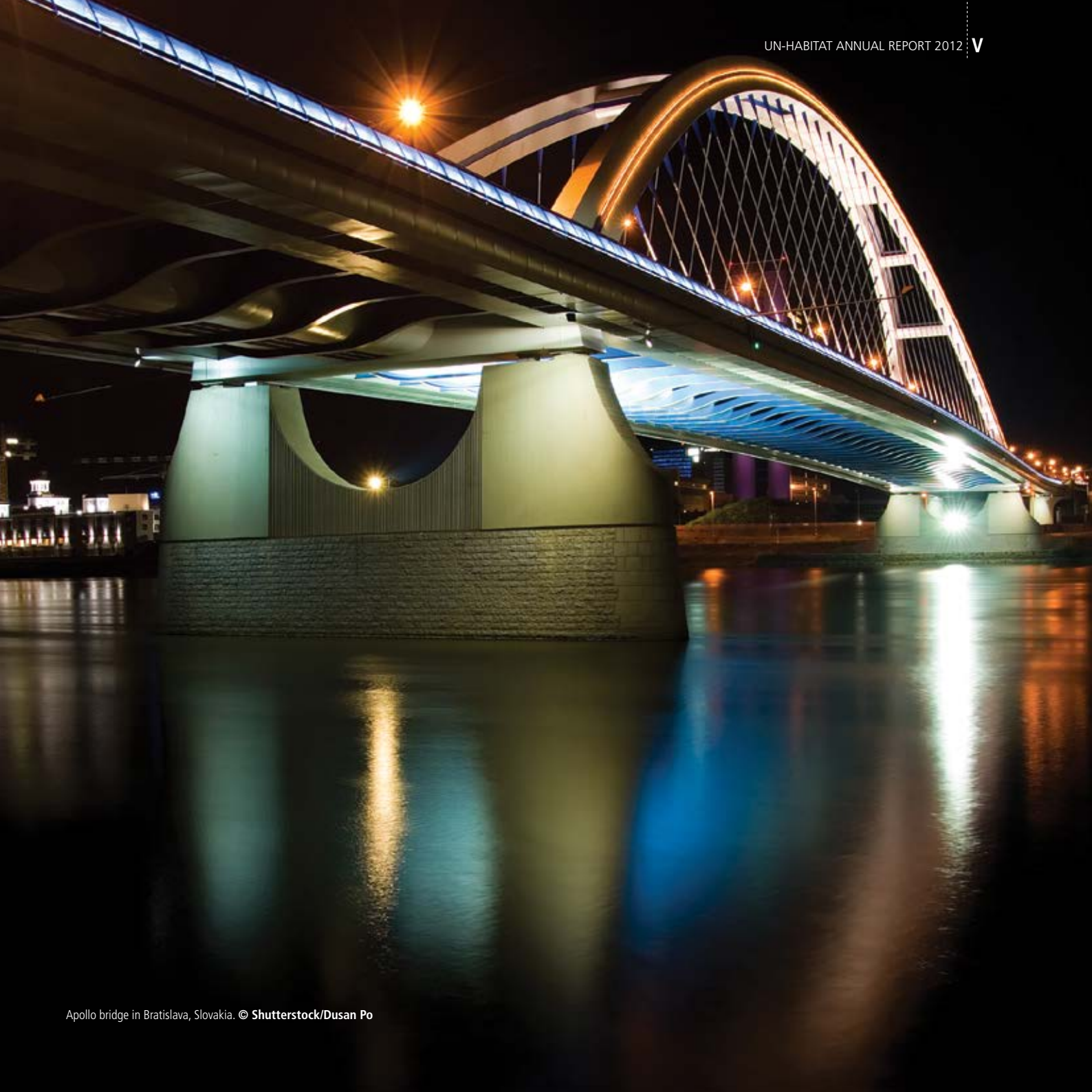
Apollo bridge in Bratislava, Slovakia.