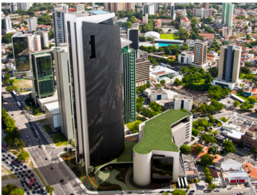
Torre Charles Darwin

On 16 December 2014, the Municipal Council of Recife, Brazil, approved the Green Roof Law. This law requires buildings with more than four floors to have their roofs covered with native vegetation. The law also applies to any commercial building with more than 400 square meters.